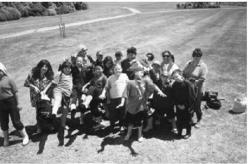
Students from Rowley School ready to embark on their visit of Travis Wetland. They were the first class to try out the new set of gum boots made available by the programme for such visits. To add to their experience the students planted native vegetation by the track between the Central Ponding Area and Mairehau Road car park.

(For bookings see below for programme and direct contact details.)