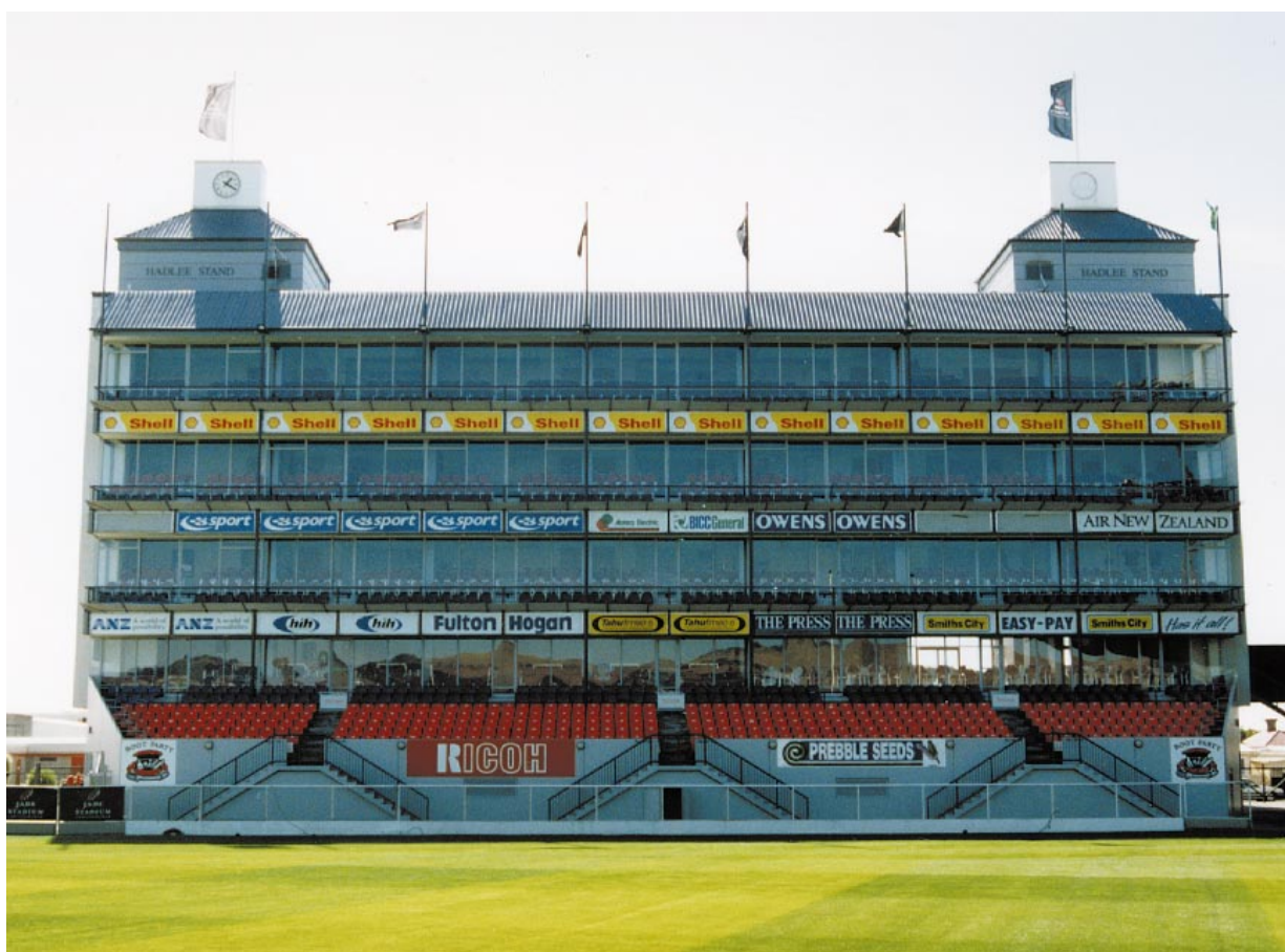
The Hadlee Stand at Jade Stadium.