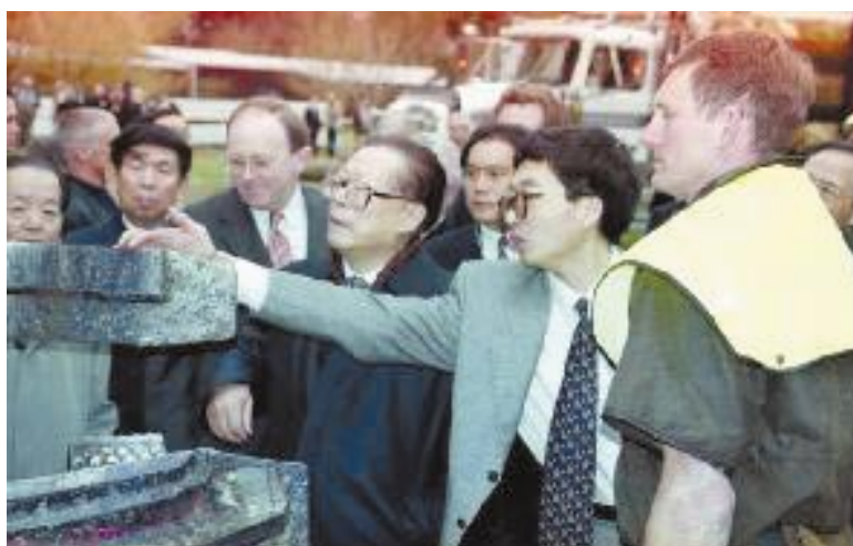
President Jiang Zemin of China inspecting logging machinery at a Selwyn Plantation Board Ltd forest, Darfield - September 1999.