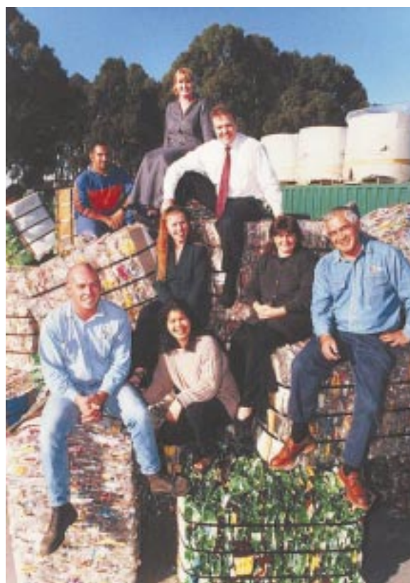
Recovered Materials Foundation staff with PET plastic bottles destined for recycling markets.