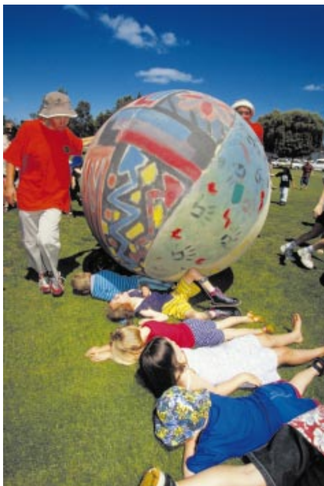
A SummerTimes Event in Hagley Park.