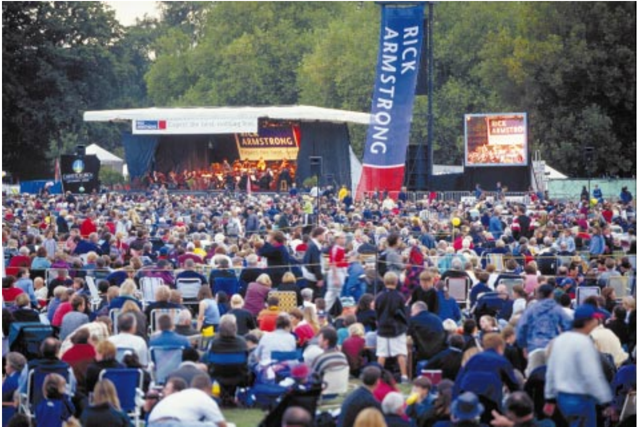
A SummerTimes concert in Hagley Park.