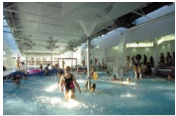
Visitors to the Centennial Leisure Centre enjoy the water.