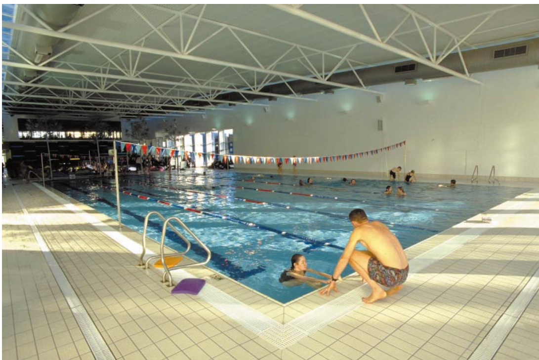
Swimmers in the main pool at the Centennial Leisure Centre.