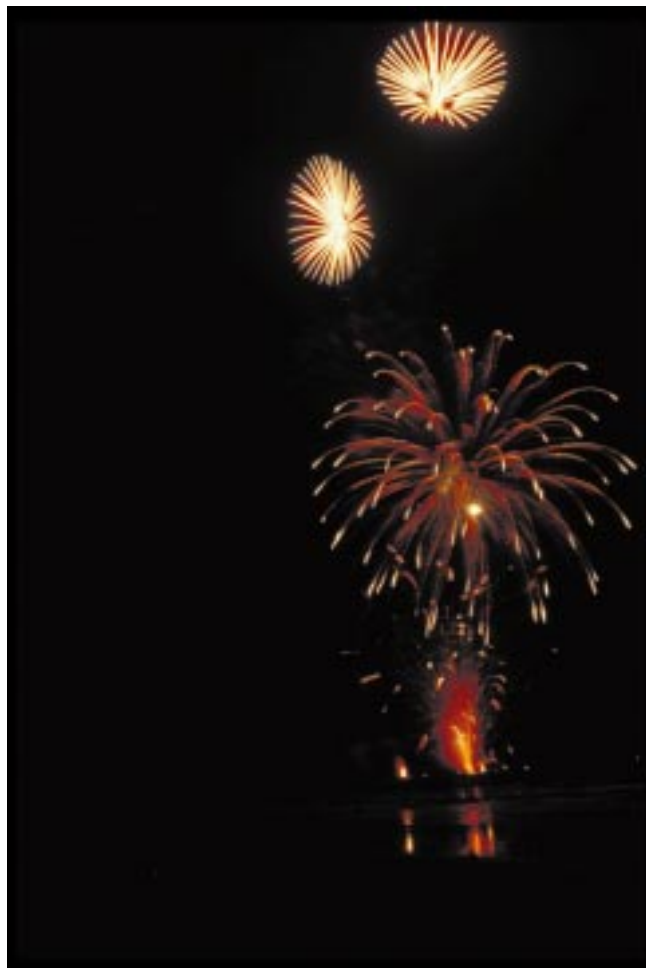
Fireworks in Hagley Park on New Years Eve.