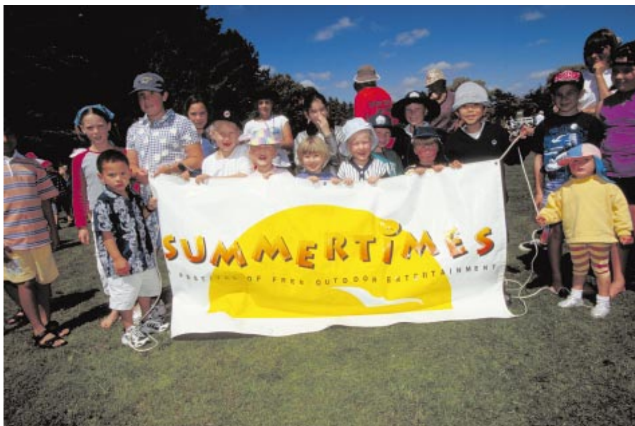
Children enjoying the SummerTimes entertainment in Hagley Park.