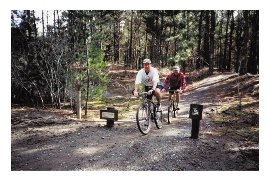
Mountain bikers enjoy the mountain bike tracks in Bottle Lake Forest.