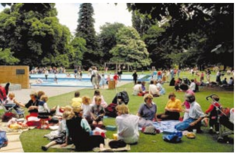
Children and parents alike enjoy the pleasant surroundings and facilities in the Children's Playground at the Botanic Gardens.