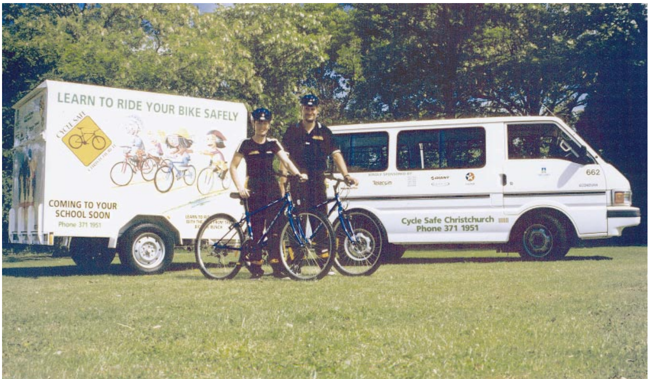
The Christchurch City Council "Cycle Safe" Team who run cycling courses in primary schools.