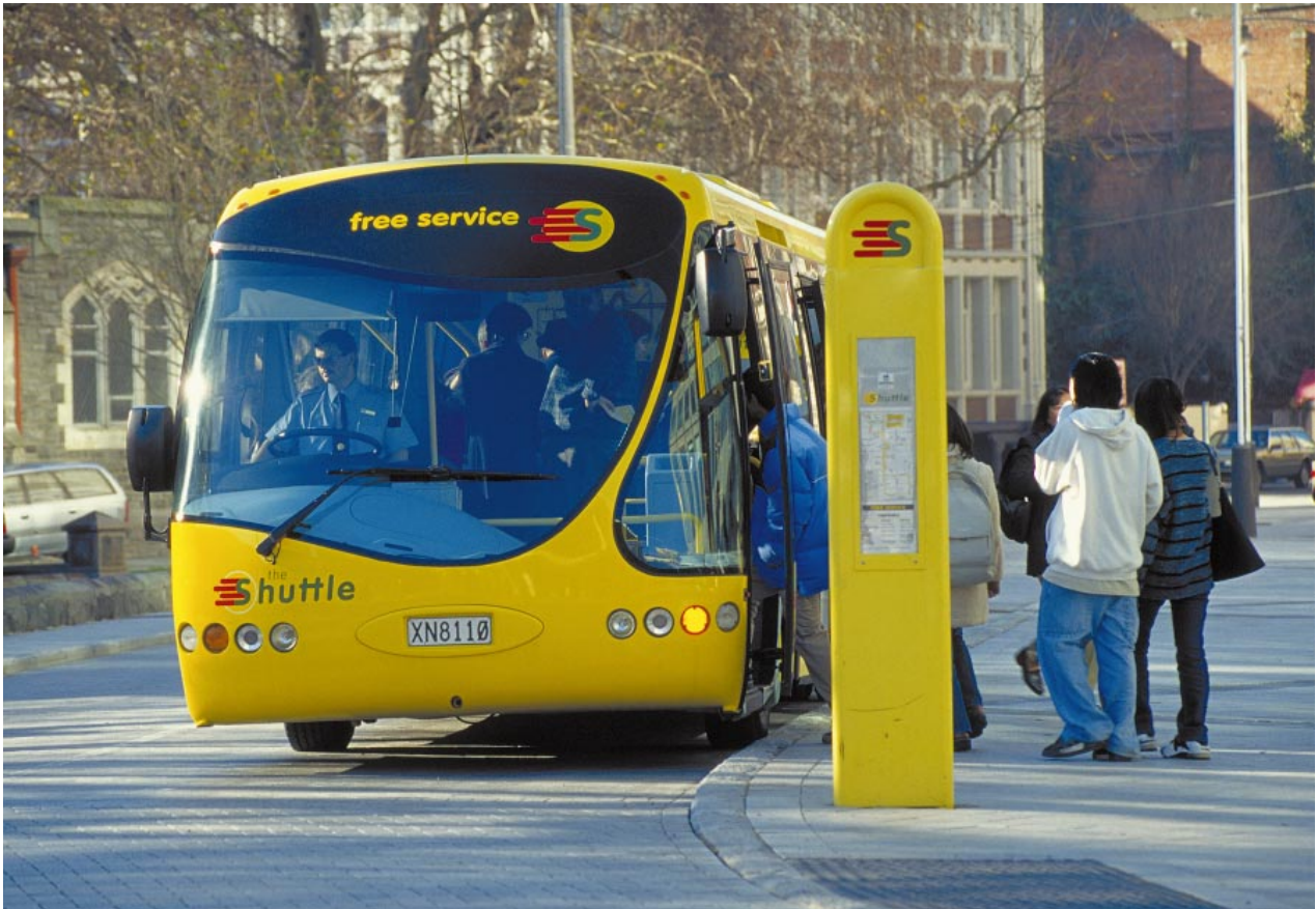
The Central City Shuttle stops to pick up passengers in Cathedral Square.