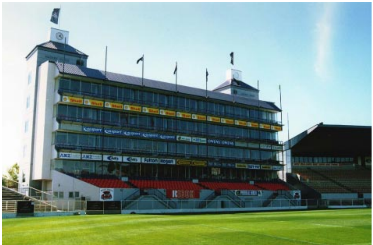
The Hadlee Stand at Jade Stadium