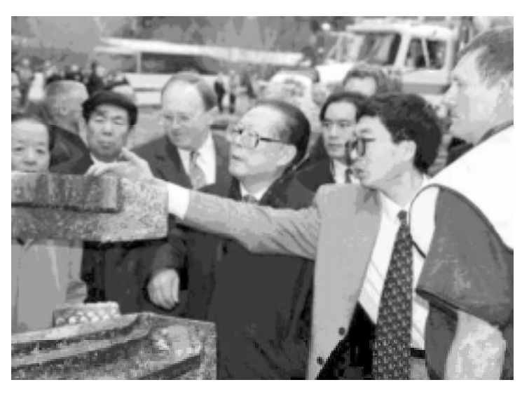
President Jiang Zemin of China inspecting logging machinery at a Selwyn Plantation Board Ltd forest, Darfield - September 1999