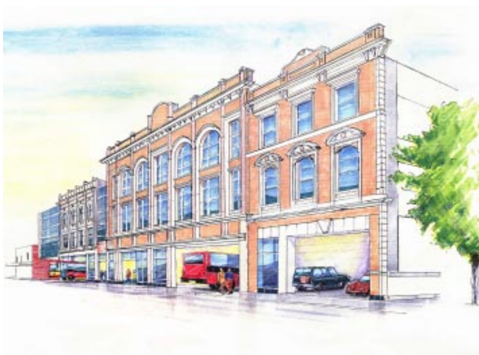
An artist's impression of the Bus Exchange at The Crossing which will become operational in November 2000