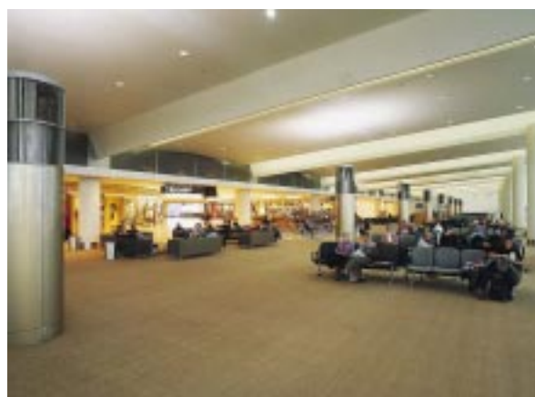
Two interior views of the recently extended Airport Company Terminal Building