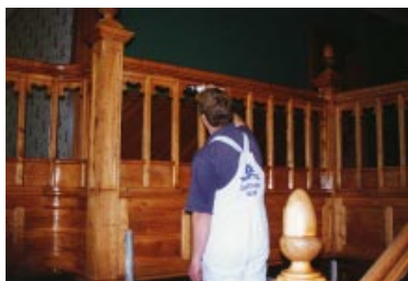
Restoration work which is being completed within the historic Riccarton House

Note: The Riccarton Bush Trust is a separate legal entity and is not therefore incorporated into the Financial Statements of the Christchurch City Council. The purpose of this page is to show the level of support by the City Council and the scope of the Trust Board activities.