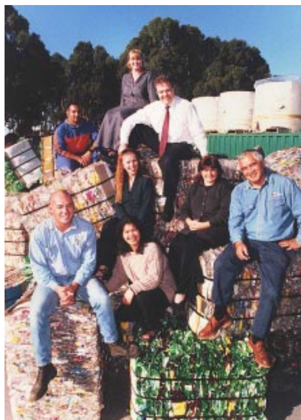
Recovered Materials Foundation staff with PET plastic bottles destined for recycling markets