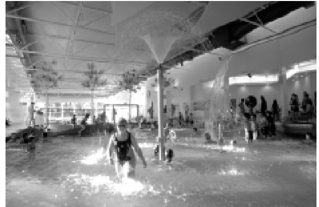
Visitors to the Centennial Leisure Centre enjoy the water.