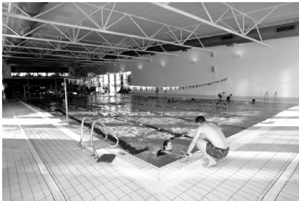
Swimmers in the main pool at the Centennial Leisure Centre