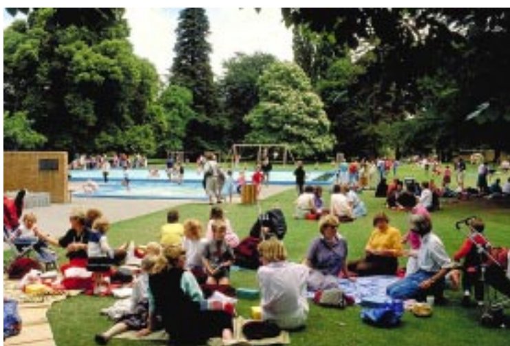
Children and parents alike enjoy the pleasant surroundings and facilities in the Children's Playground at the Botanic Gardens