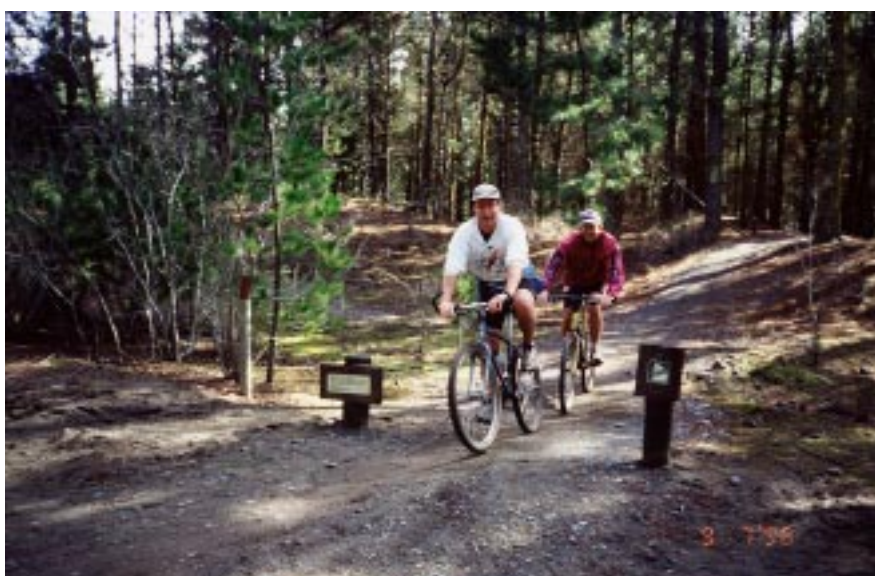
Mountain bikers enjoy the mountain bike tracks in Bottle Lake Forest