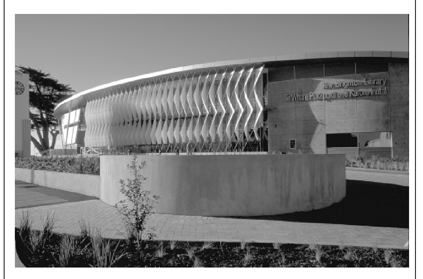
Two different views of the New Brighton Library which was opened on 24 July 1999