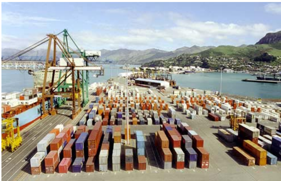
The Container Terminal at the Lyttelton Port Company.