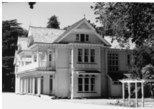
The north facing side of Riccarton House.

Note: The Riccarton Bush Trust is a separate legal entity and is not therefore incorporated into the Financial Statements of the Christchurch City Council. The purpose of this page is to show the level of support by the City Council and the scope of the Trust Board activities.