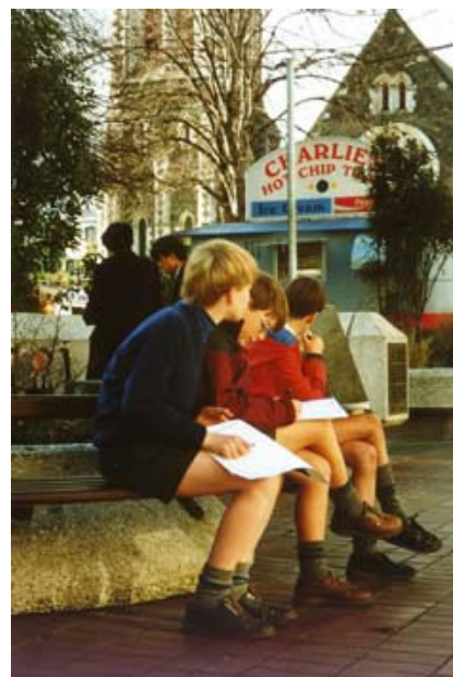
Young minds at work on some proposals for the redevelopment of Cathedral Square.