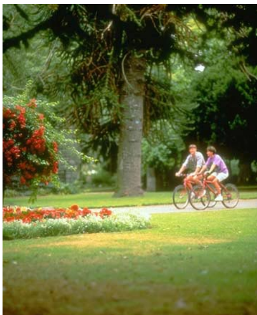
A summer-time scene in Hagley Park.