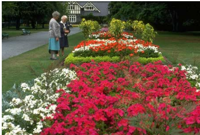
Spring-time in the Botanical Gardens.