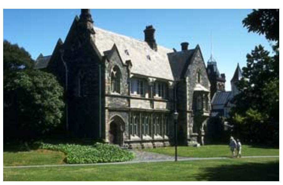
A riverside view of the recently renovated Canterbury Provincial Buildings.