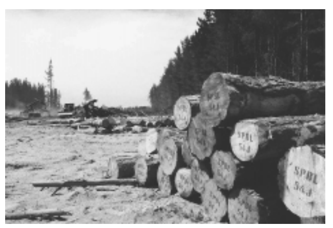
Logging at a Selwyn Plantation Board Ltd Forest.