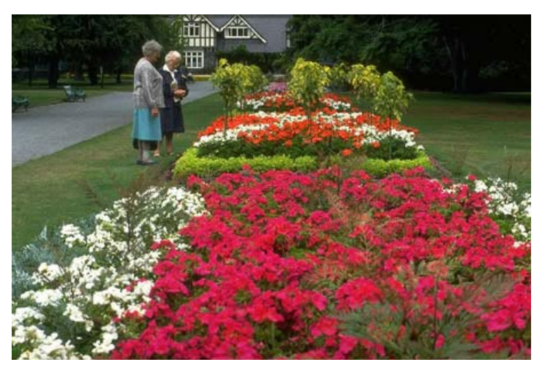
Spring-time in the Botanical Gardens.