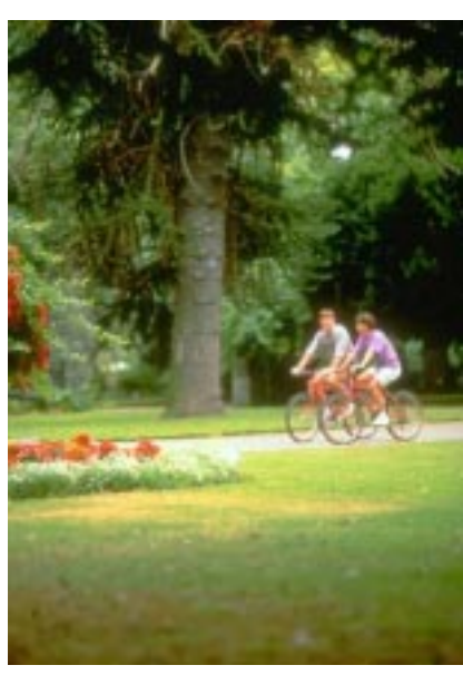
A summer-time scene in Hagley Park.