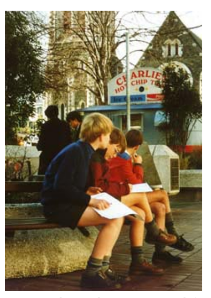
Young minds at work on some proposals for the redevelopment of Cathedral Square.