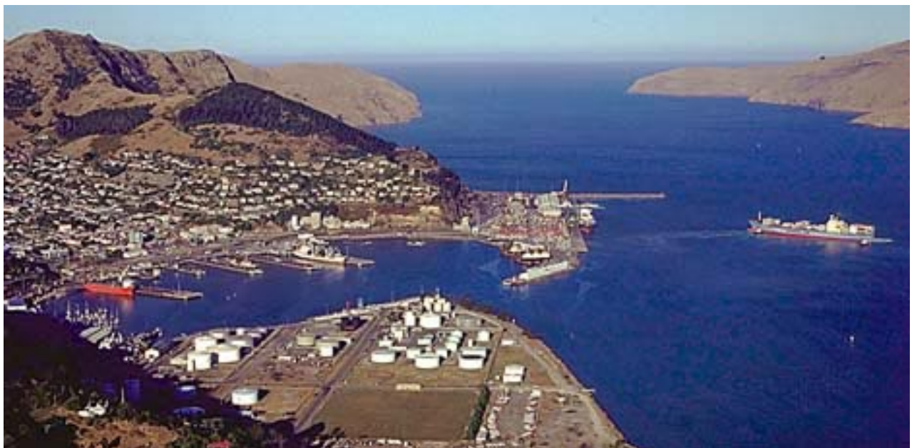
Looking down onto the Port facilities and Lyttelton Harbour.