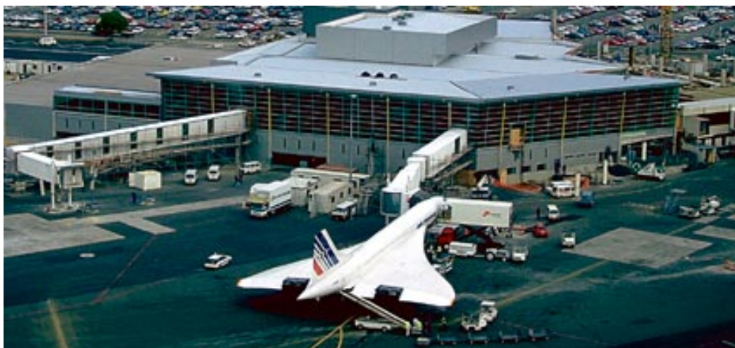
The recently opened international terminal building.