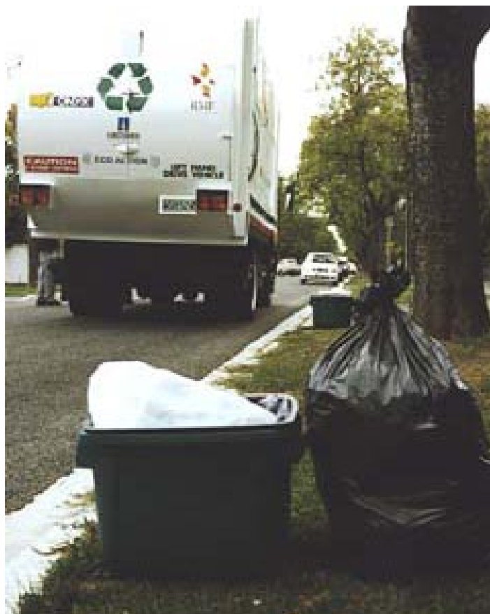
Kerbside recycling crates awaiting pickup by the Recycling Truck. Kerbside recycling will be fully operational for the whole city in 1998/99.

Significant progress on planning and development of new Regional Landfill.