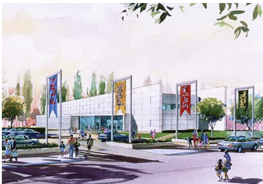
An artist's impression of the new Centennial Pool, which will be completed around April 1999.