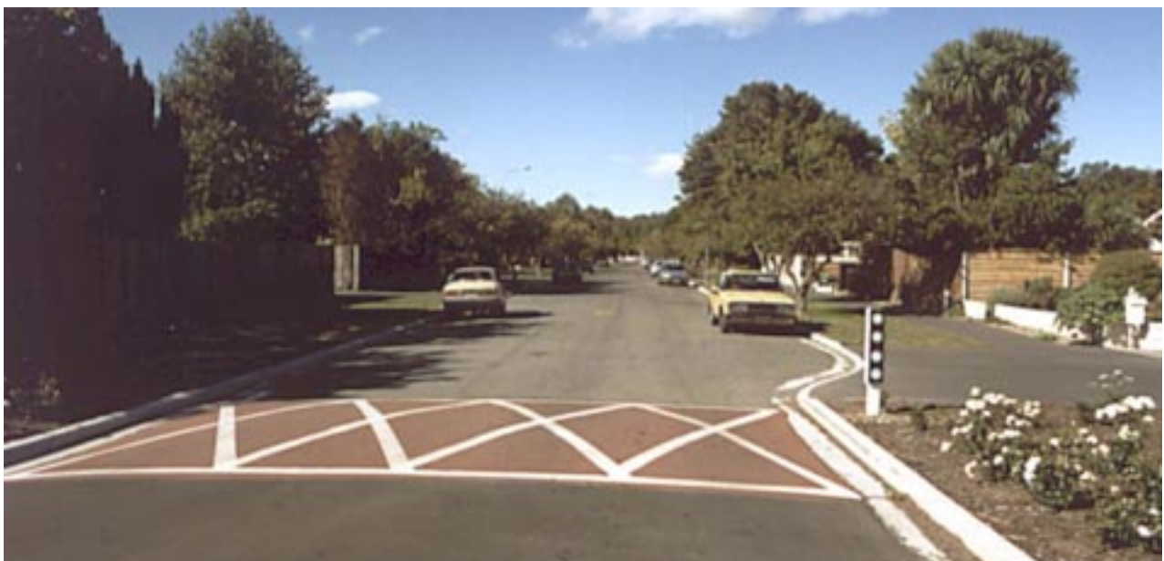
Recently completed reconstruction work on Totara Street.