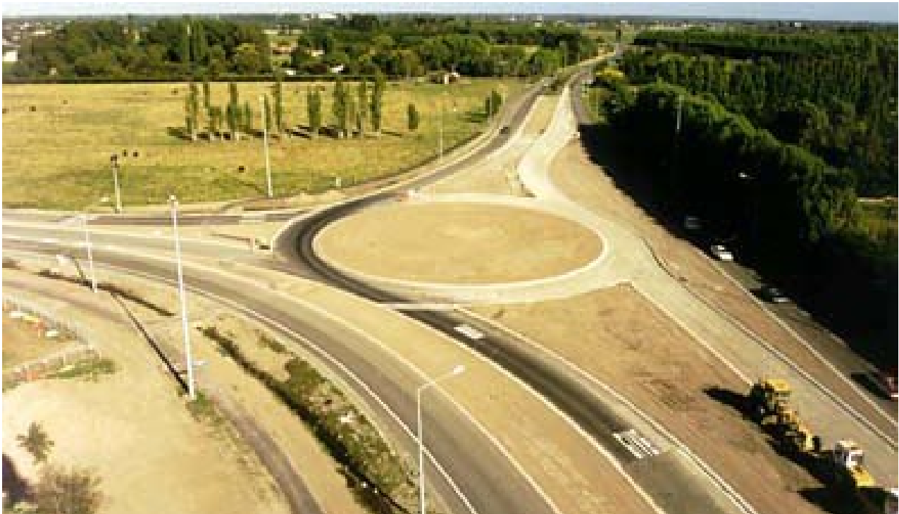
Roundabout reconstruction in progress at QE II Drive/Innes Road.