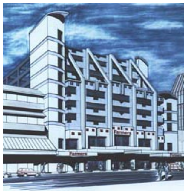
An artist's impression of the new Central City Carpark, which will be completed in January 1999.