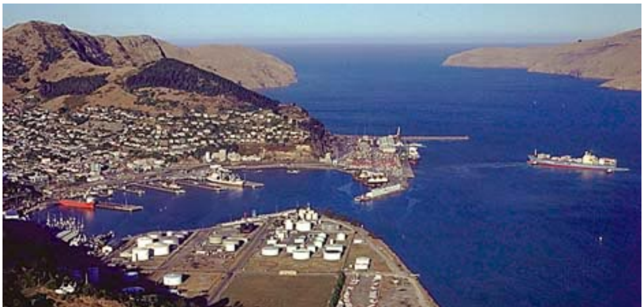
Looking down onto the Port facilities and Lyttelton Harbour.