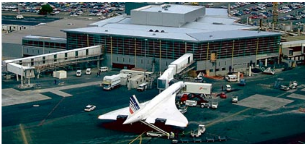
The recently opened international terminal building.