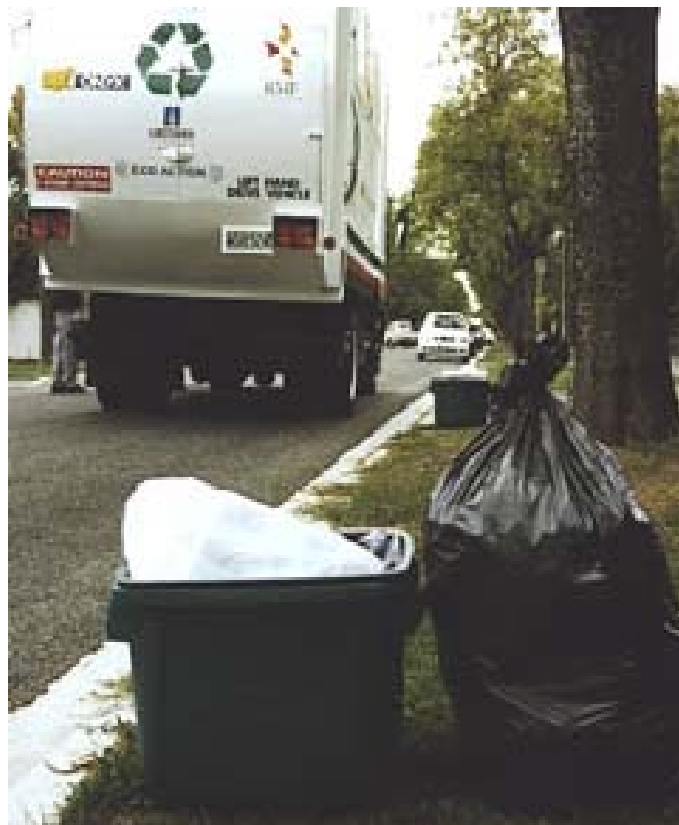
Kerbside recycling crates awaiting pickup by the Recycling Truck. Kerbside recycling will be fully operational for the whole city in 1998/99.

Significant progress on planning and development of new Regional Landfill.