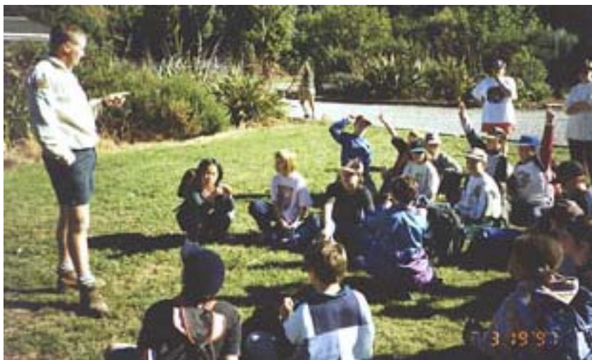
A Parks Ranger with school pupils on a forest study field trip.