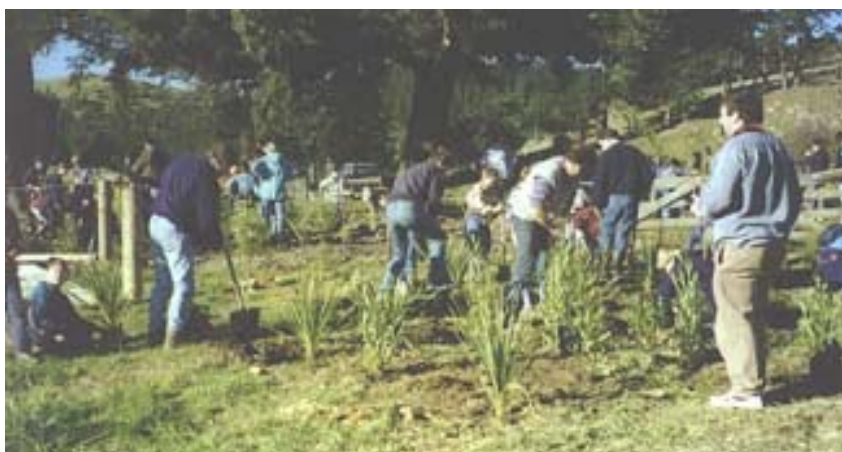
The Halswell Scout group involved in native plantings at Halswell Quarry Park.