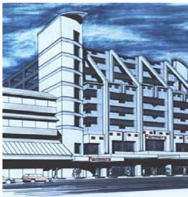
An artist's impression of the new Central City Carpark, which will be completed in January 1999.