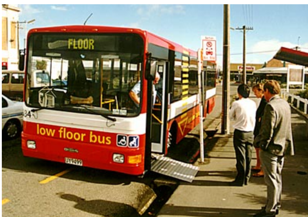
Modern accessible low floor buses were introduced in February 1997 bringing new standards of service to Christchurch