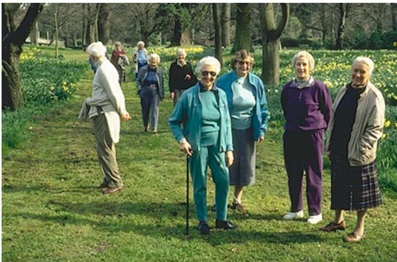
Spring time in Hagley Park enjoyed by some of the many visitors.