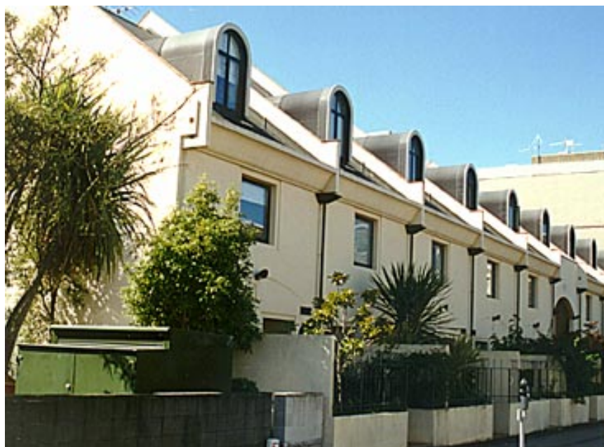
Examples of the redevelopment of Inner City housing.