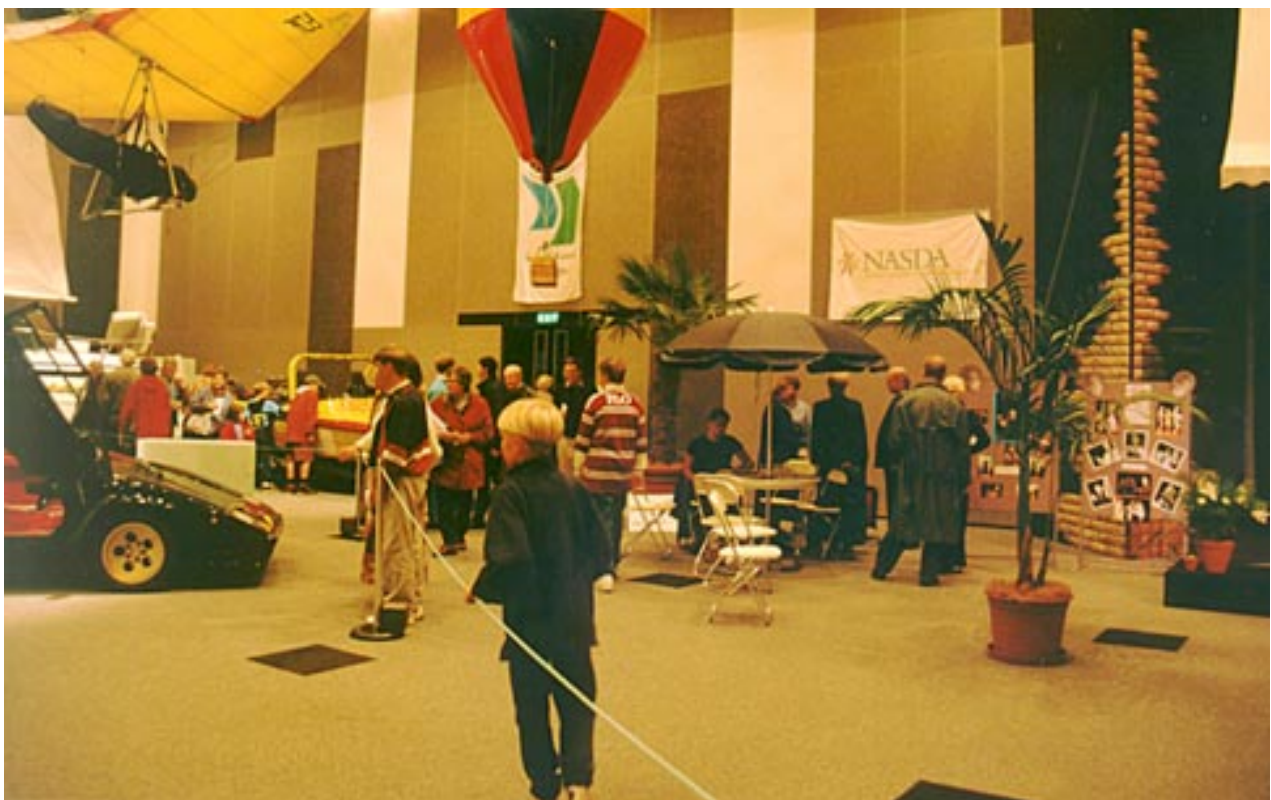
The main hall of the Convention Centre on 'Open Day'.