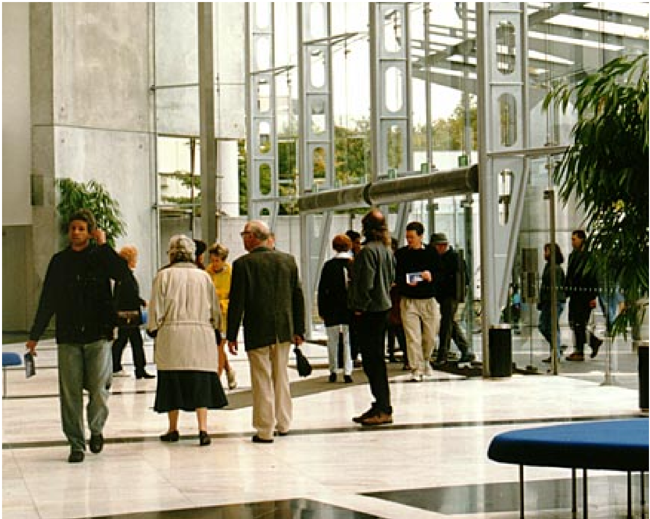
'Open Day' at the Convention Centre.