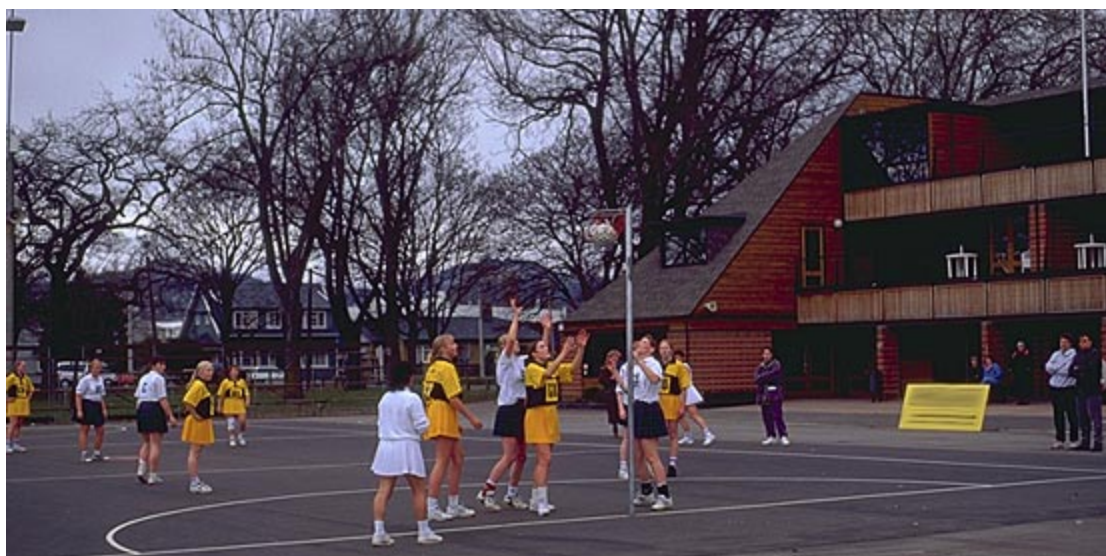
Netball being played at the South Hagley Park Netball Courts.