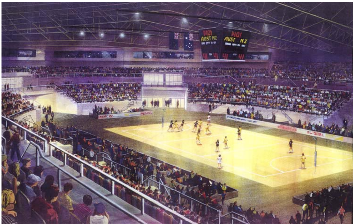
An artist's impression of the Sports and Entertainment Centre's main arena set up for centre court sports.