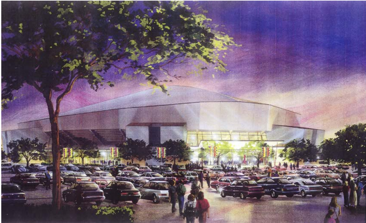
An artist's impression of the planned Sports and Entertainment Centre which will be built at Addington and is scheduled to open in August 1998.