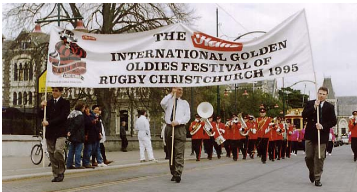
The parade along Worcester Boulevard to mark the opening of the International Golden Oldies Festival of Rugby. The Council played a significant part in ensuring that Christchurch hosted the 1995 Festival.