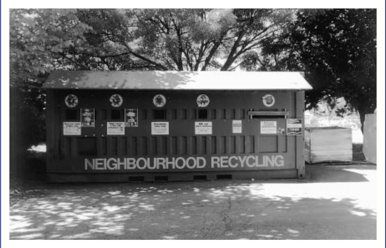
The Beckenham Service Centre recycling point. The Council employs a local group to maintain this facility and all benefits are returned to the Community.