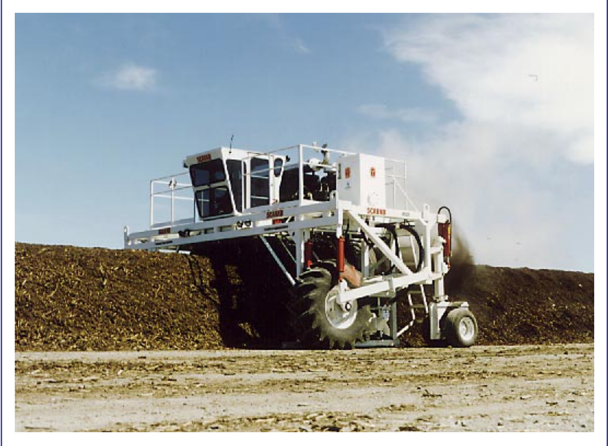
The Scarab Windrow Turner working on a row of shredded green waste at the Composting Facility, Metro Place Transfer Station.