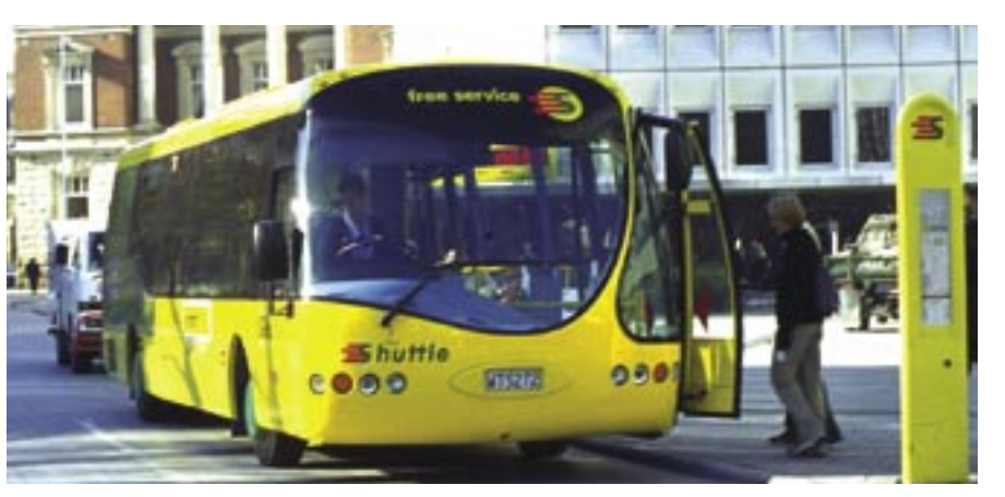
Free Shuttle Service