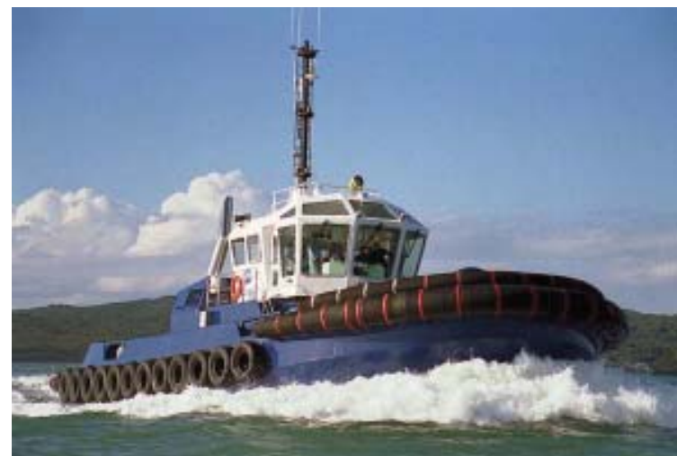
The LPC's new tug boat 'Blackadder'.