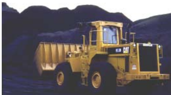
Coal is the largest export through the port.