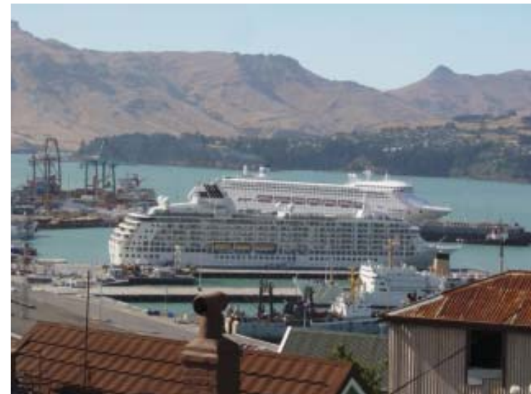
Recent arrivals at the Port.