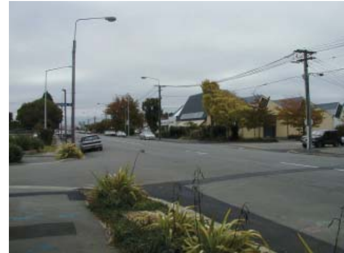
Before and after undergrounding work in Shakespeare Road.