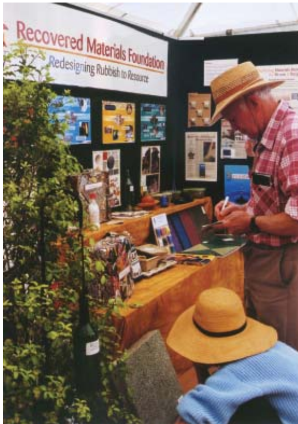
One of the many displays the Recovered Materials Foundation organises to show the use of "recovered materials".