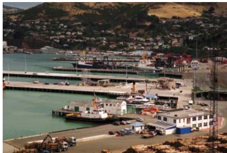
Lyttelton Port Company facilities with Lyttelton in the background.