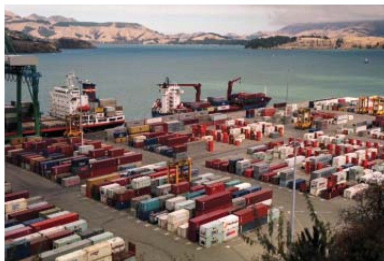
The Container Terminal at the Lyttelton Port Company.