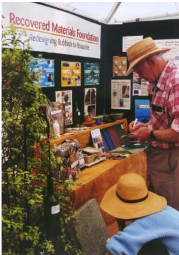
One of the many displays the Recovered Materials Foundation organises to show the use of "recovered materials".