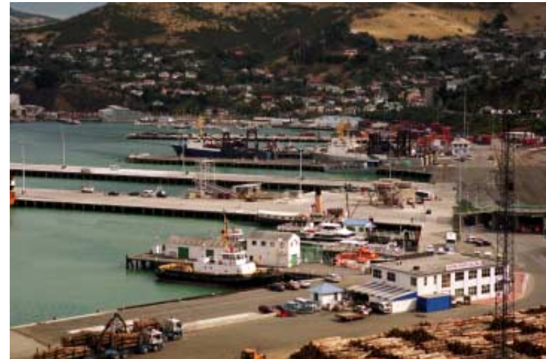
Lyttelton Port Company facilities with Lyttelton in the background.