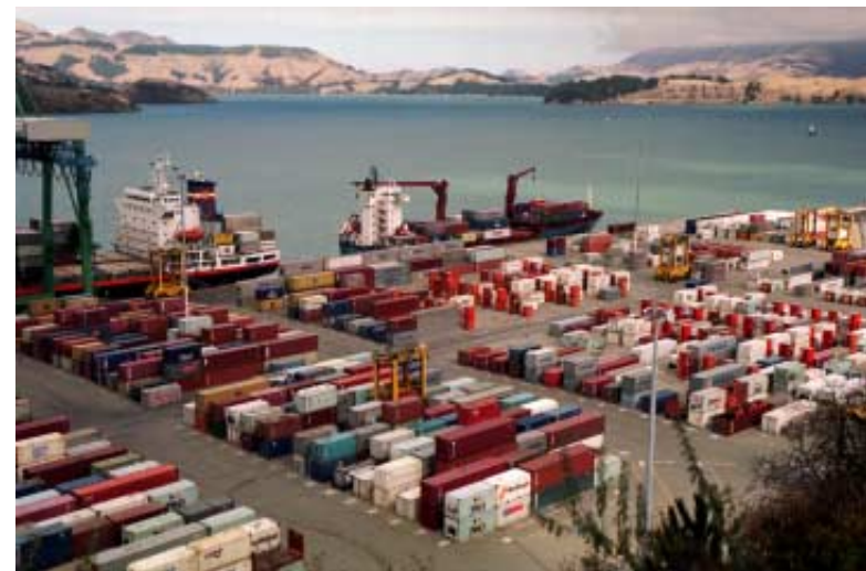
The Container Terminal at the Lyttelton Port Company.