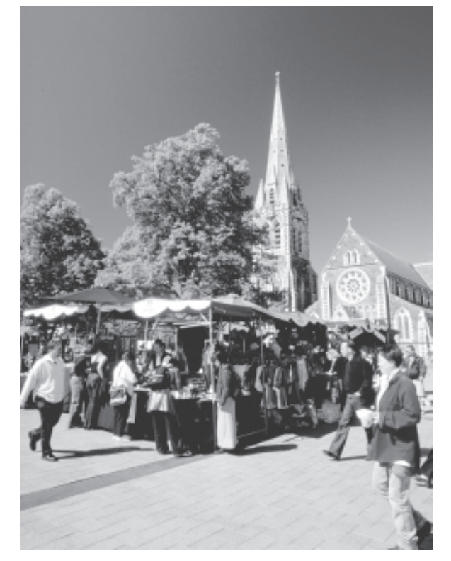
Weekday stalls in Cathedral Square