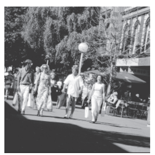
Shoppers enjoy the shops and surroundings in the Central City

A survey will be conducted within the area identified to seek a response on support for a separate rate.