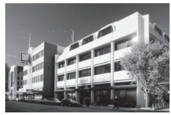
The Orion building in Manchester Street